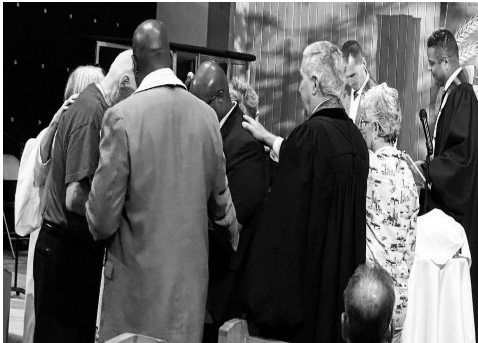
A Moment of Blessing