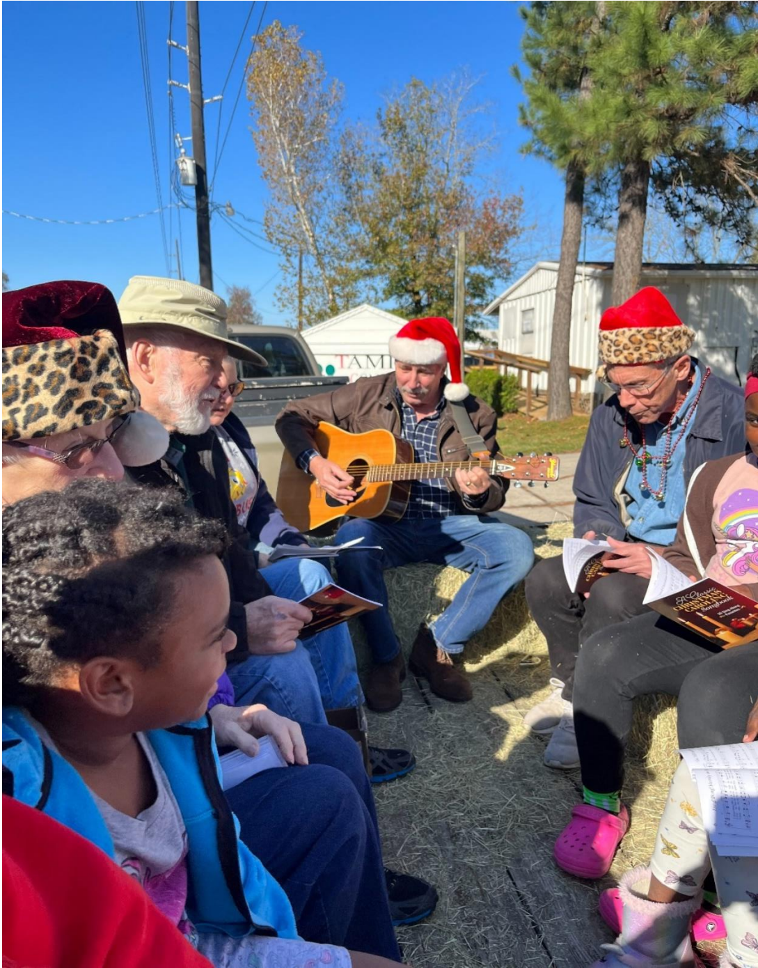
Christmas Caroling at Open Arms-December 17, 2022