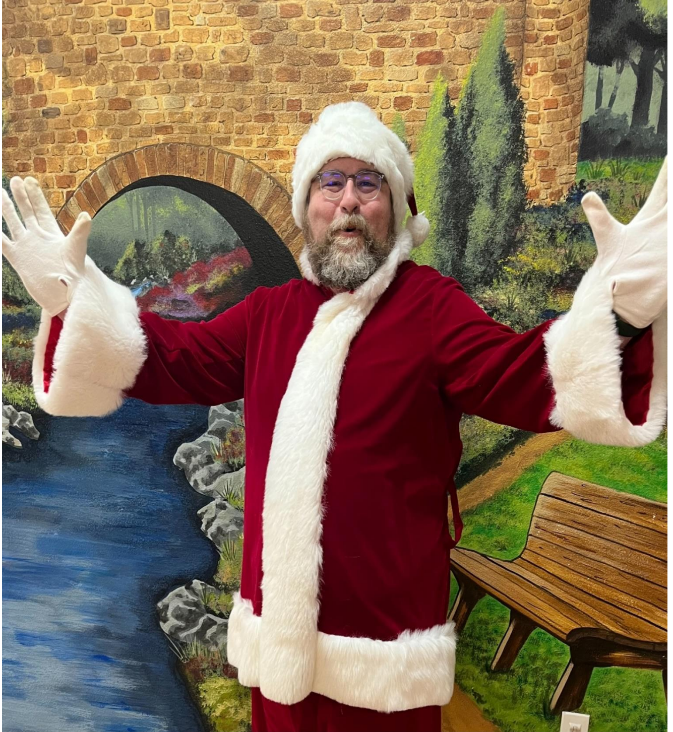
Santa Claus joins our Open Arms Carolers – December 17, 2022